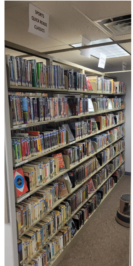
Neat and re-organized