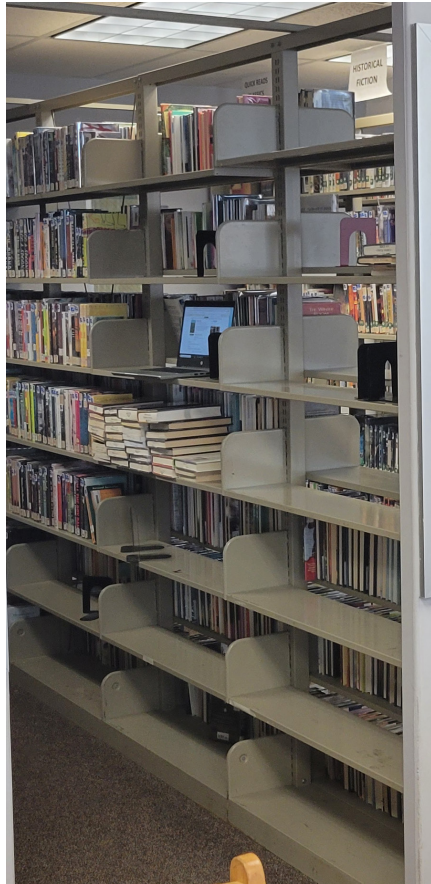
During the process